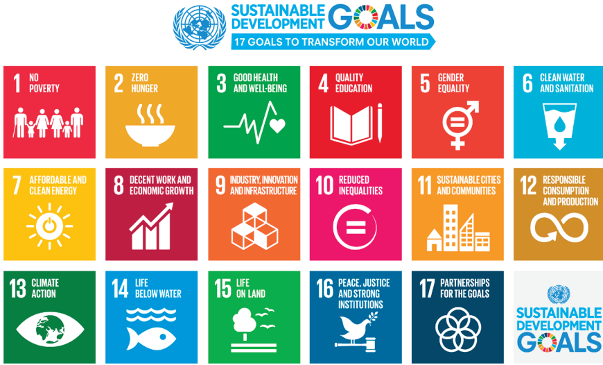
Figure 4 Sustainable Development Goals.

sustainability and together with the report on the role of livestock in SAD and FSN (HPLC, 2016) provide guidance to existing initiatives such as the DSF, the Global Agenda for Sustainable Livestock partnership (GASL, 2016), Livestock Environment Assessment and Performance partnership (LEAP, 2016) and Dairy Asia.